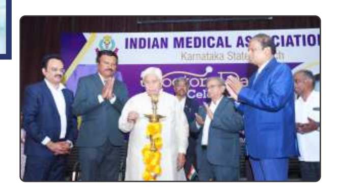
Photo Gallery IMA Karnataka State Branch Doctors' Day-2024 Celebration Memories